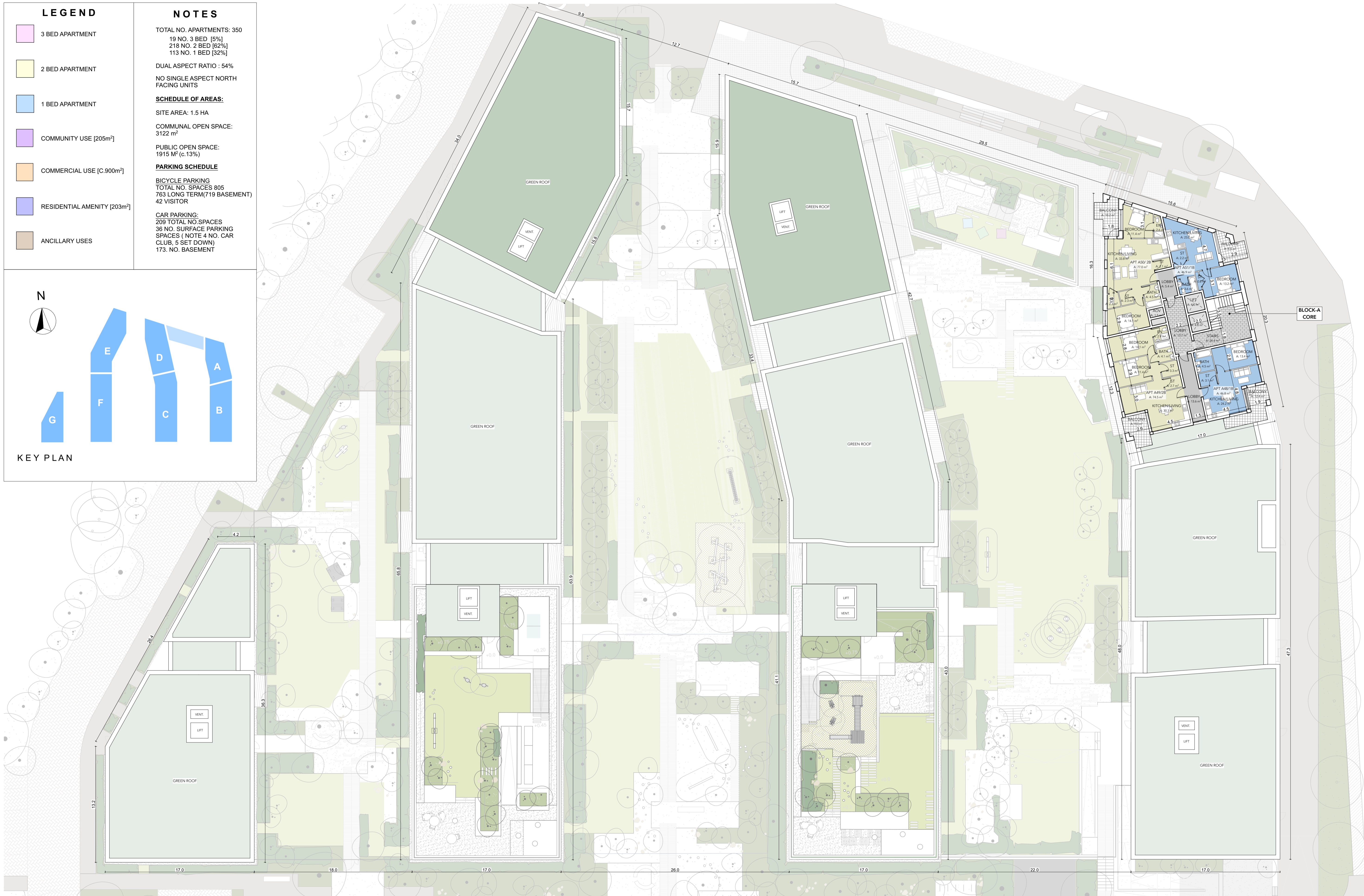
Eleventh Floor Plan SCALE : 1:200